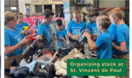
Organizing stock at St. Vincent de Paul