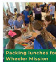
Packing lunches for Wheeler Mission