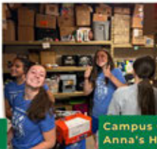
Campus Clean-up at Anna's House