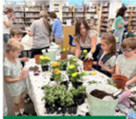
Making & Delivering Flower Pots to Neighbors

Our 2026 Service Day sent our students out into the city to lend a helping hand and help share hope and some smiles with families and organizations in need!