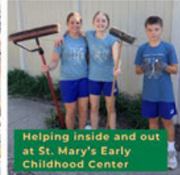
Helping inside and out at St. Mary's Early Childhood Center