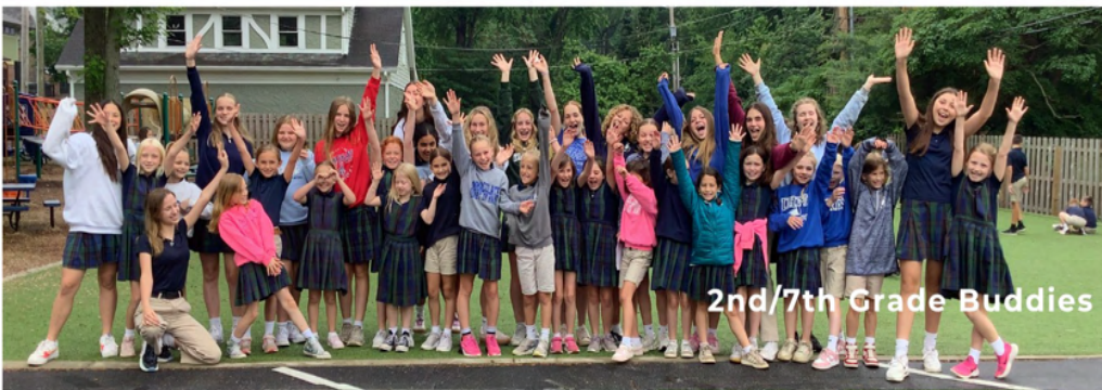
2nd/7th Grade Buddies