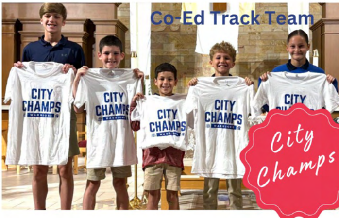
Co-Ed Track Team