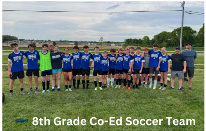
8th Grade Co-Ed Soccer Team