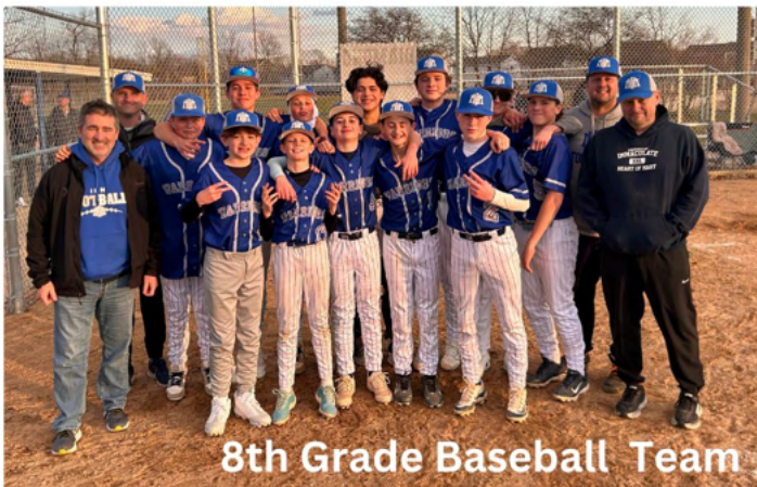
8th Grade Baseball Team