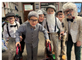
100th Day of School!