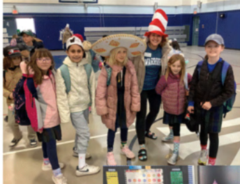
Crazy Hat & Sock Day!

From our heads to our toes and from age five to 100, we loved celebrating our IHM Catholic School this week with fun spirit days and events!