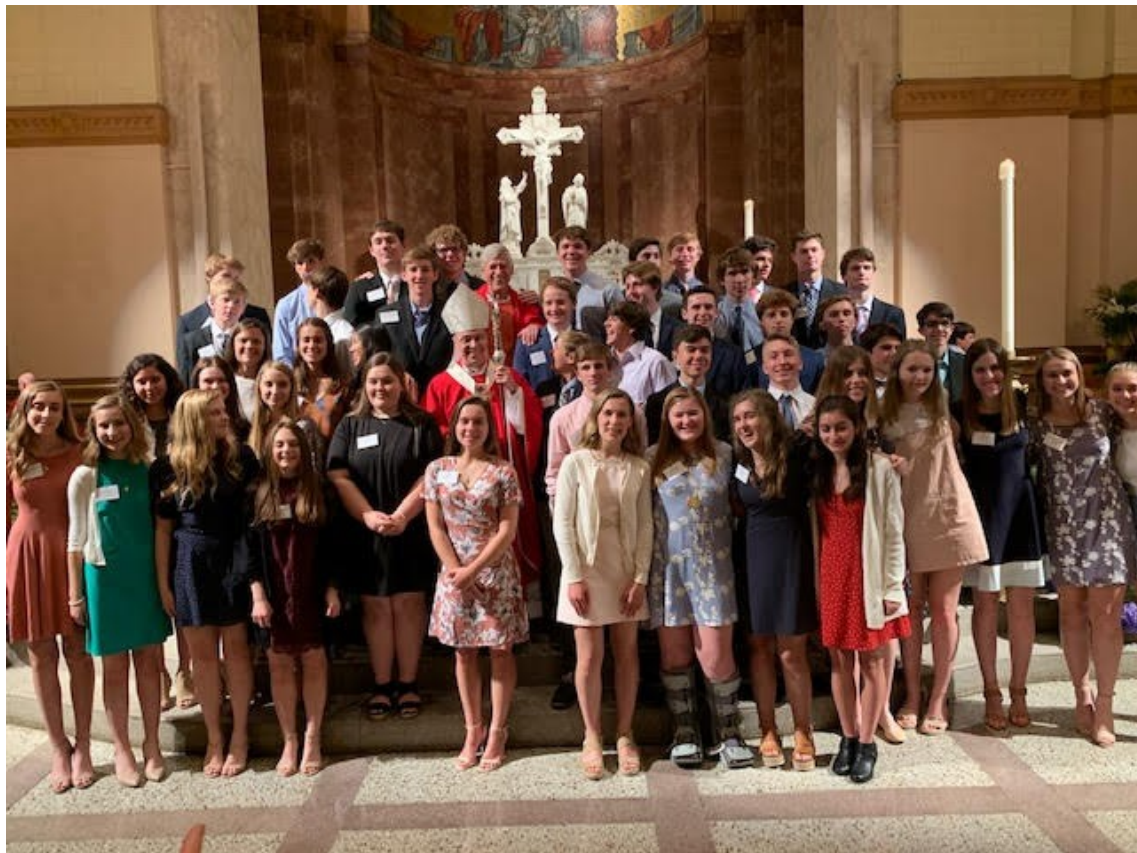
Congratulations to our newly Confirmed!